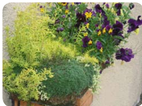
Tony's Bird Box