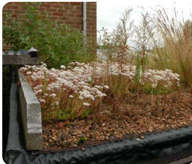
Jeff's Garage: example of a gravel margin

PLEASE NOTE Specialist support and Building Regulations must be consulted before greening roofs over occupied buildings, or those attached to occupied buildings. It is advisable to contact your local council's building control department before proceeding, especially if the roof you are constructing is on a boundary with another property, or if your project involves structural changes.