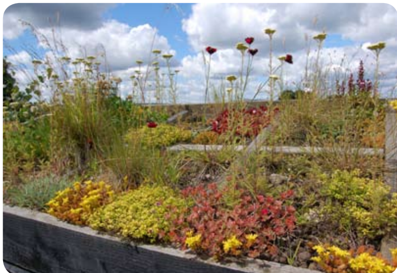
Nigel's Shed: example of a 'chequerboard' pattern

If the slope of the roof is over 20° you will need to ensure that the green roof does not slip. Slippage can be prevented through the use of wood or a metal grid laid on top of the root-proof membrane in a 'chequerboard' pattern.